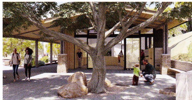
MITCHELL CANYON VISITOR CENTER | MOUNT DIABLO STATE PARK